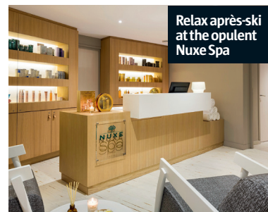
Relax après-ski at the opulent Nuxe Spa

Grab your skis at the in-house shop, dine with views of Mont Blanc, treat yourself to warming winter cocktails at the bar and, for post-ski relaxation, head to the dreamy Nuxe Spa.