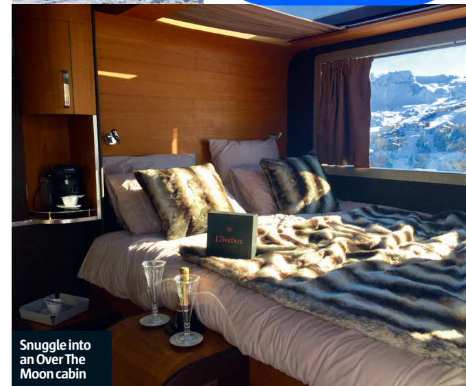
Snuggle into an Over The Moon cabin